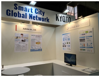
Pavilion (SPREAD is on the right)